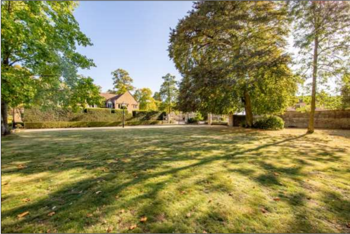
Main Entrance & Front Lawns