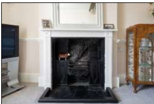
Sitting Room Fireplace