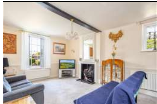
Apartment Sitting Room