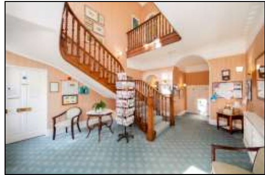
Main Entrance Hall