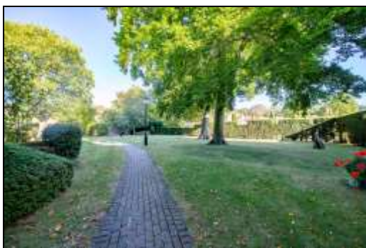
Communal Grounds to the Rear