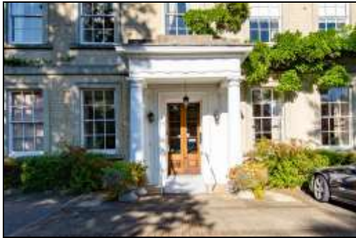
Main Entrance Porch