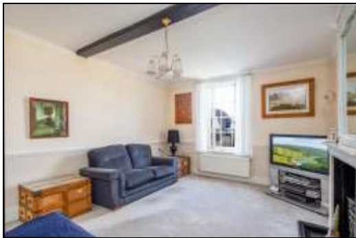
Apartment Sitting Room