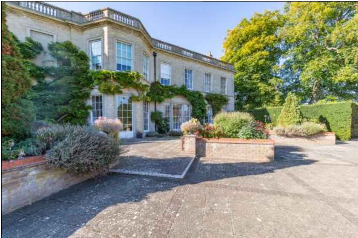
Communal Sun Terrace