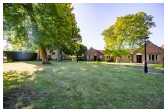
Communal Grounds to the Rear